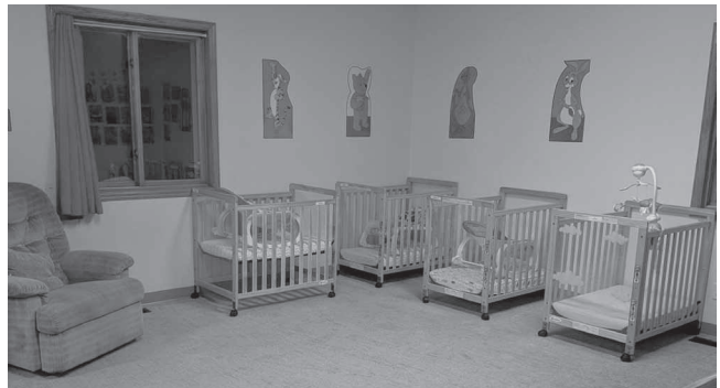
At the time of publishing, Lil' Gov's Bright Beginnings provides childcare for 30 children, including space for five children under 1 year old.

While Hartford is served by Sioux Valley Energy, the Corsica and Parkston communities rely on other, non-co-op power sources. Still, the projects were approved for REED funding because ultimately, co-ops’ goals are to improve rural communities and the lives of their members in and around those communities.