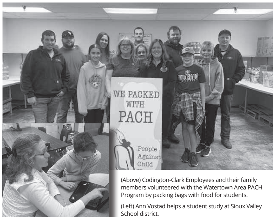
(Above) Codington-Clark Employees and their family members volunteered with the Watertown Area PACH Program by packing bags with food for students.

"They look forward to it," she said. "Once you do it, you want to keep coming back."