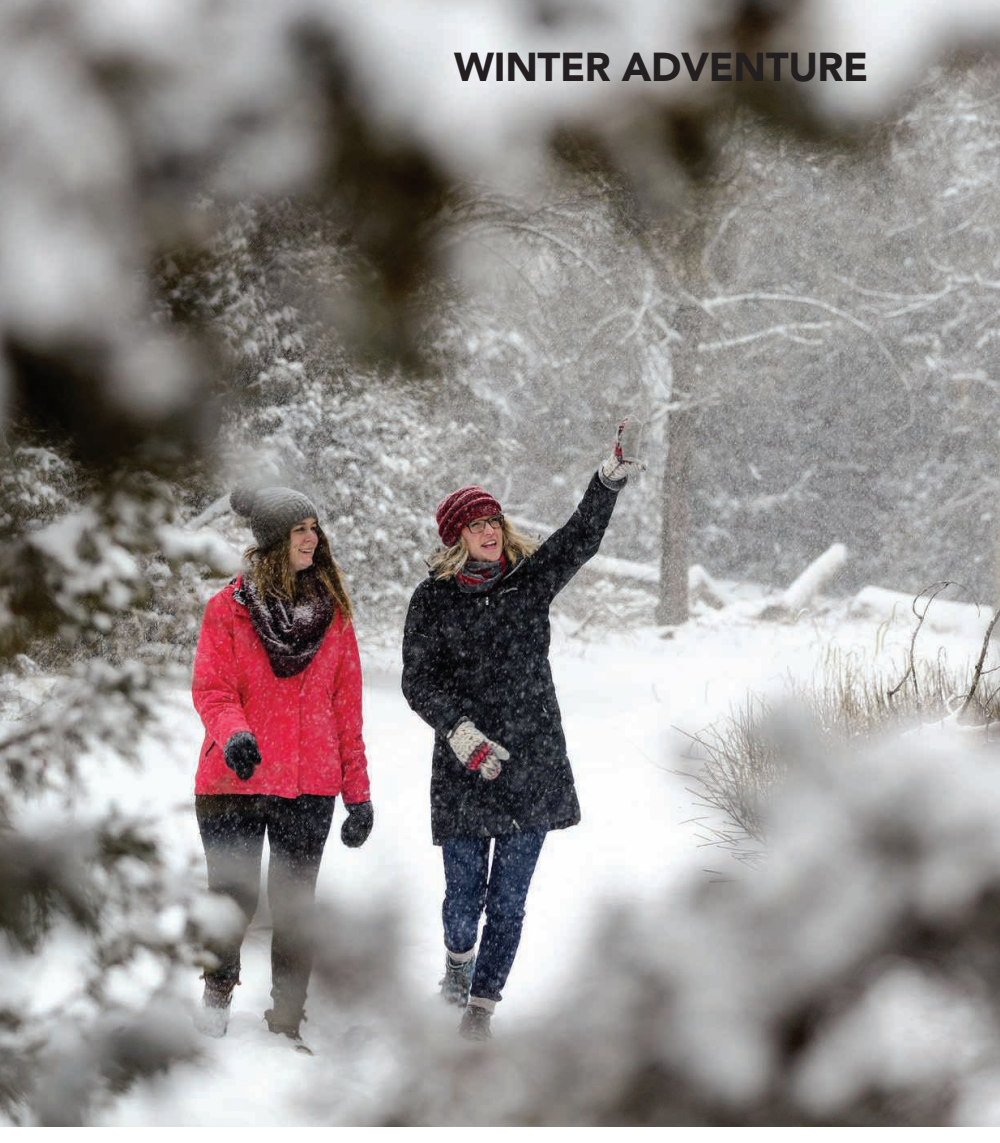
Time spent outdoors during the winter can be beneficial to mental and physical well-being.

World-renowned summertime attractions such as the iconic Mount Rushmore and Crazy Horse destinations take on an entirely different appeal during the snowy season. The Badlands geological formations, Ponderosa pine forests, open prairies, secluded lakes and