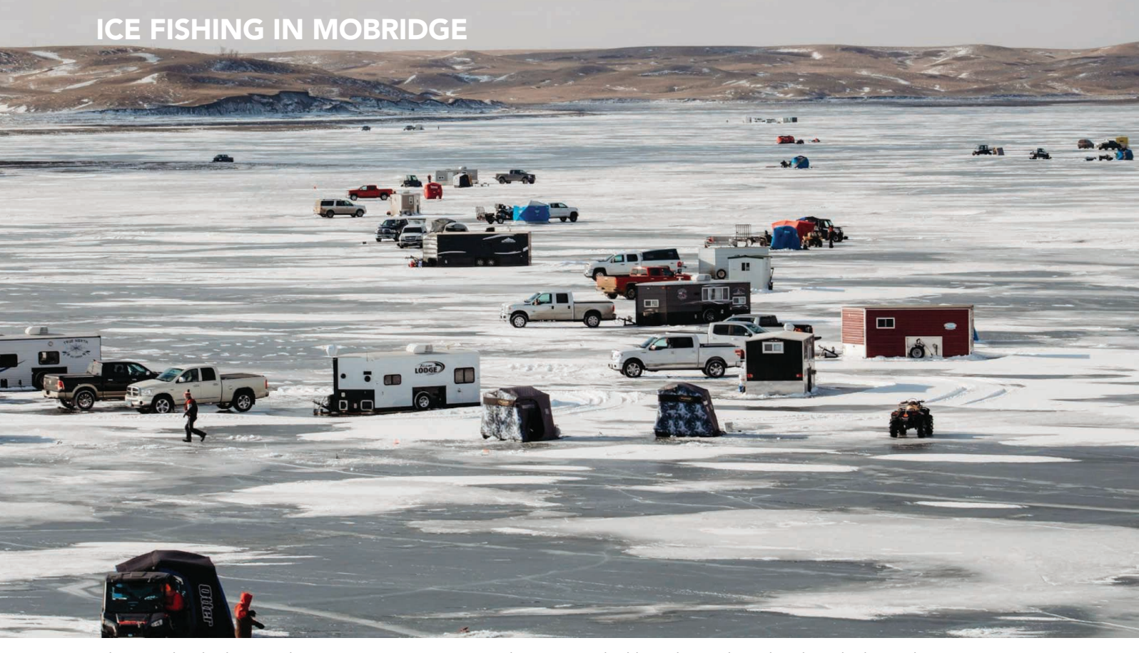
The annual Mobridge Ice Fishing Tournament attracts more than 1,000 avid cold-weather anglers.