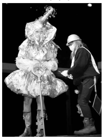
The annual "Nail the Runway" event staged by the Brookings Area HFH is a "fashion show with a twist."

"It's very fulfilling for everyone involved to see a home build take shape and to see so many people put their