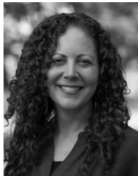
Miranda Boutelle Efficiency Services Group

Q: What are some energy efficiency upgrades I should consider when building a new house?