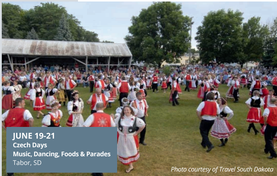
JUNE 19-21 Czech Days Music, Dancing, Foods & Parades Tabor, SD