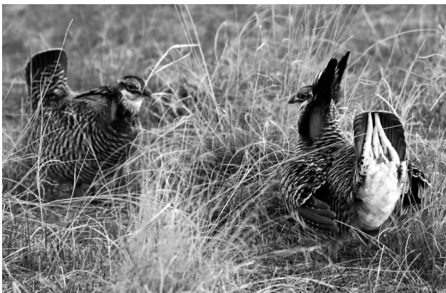
Two greater prairie chickens contend for their position in the lek.

The prairie doesn't just host the lek, it defines it. Before the females arrive, the males compete for alpha status by laying claim to the hotly contested ground at the center of the lek. Positioning is everything. What follows is a series of tense showdowns – staring matches, fluttering wings, bickering squabbles and the brandishing of talons – as each contender fights to control the prime real estate.